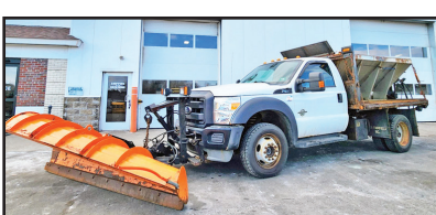
2013 Ford F450 DUMPING FLATBED. Diesel, Sander, Power Angle Front Blade, $18,500.