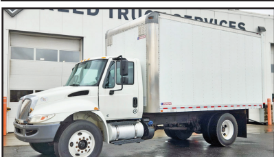
2018 INTERNATIONAL 4300. Non CDL., Cummins Engine, Allison Trans, AB, AR, 16' Morgan Body, $44,500., Will Separate

Email: scott@reedtruck.com • www.ReedTruck.com • 1-800-542-5032