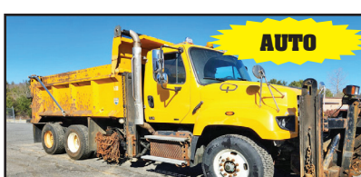
2013 FREIGHTLINER SD114. DD13 Engine, Allison Trans, Everest 14' Live Floor Body, Truck Includes Plow And Wing Blades. Well Maintained Muni Trade. $59,900.