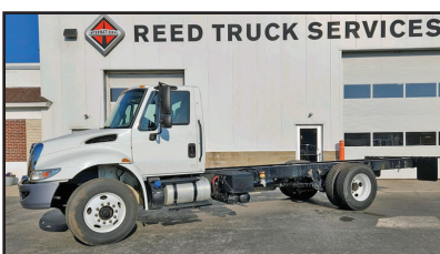
2016 INTERNATIONAL 4300 Cab & Chassis. AR/AB, Cummins Engine, Allison Auto, Non-CDL. $42,500.