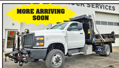
NEW 2023 INTERNATIONAL CV515 4x4. 6.6 Diesel, Allison Trans, Locking Rear, 10' Lanau Hardox Dump, Everest Plow, Wing & Hitch Included, $149,900.