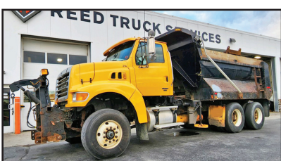
2006 STERLING, 380 HP 8LL, 18FA, 46 Rears, Pwr Reversible Blade And Wing, Live Floor Sander Dump, Double Spinners, $29,800