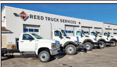
NEW INTERNATIONAL CV 4x4, AND HV 4X2 AND 6X4 MUNICIPAL CHASSIS. Available, Call For Specs!