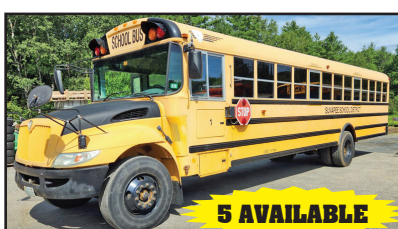
SEVERAL USED 2006-2016 INTERNATIONAL IC SCHOOL BUSES. Most Of These Need Some Work, Priced Starting at $1,800.