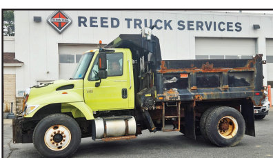
2007 INTERNATIONAL 7400 10' (Rough) Dump Body. 14 F/A, DT466, Allison Trans, 30 R/A Locker, 66,000 Miles, Plow Hitch Included, $12,500