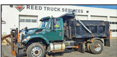
2012 INTERNATIONAL 7400 Dump. 16 F/A, Locking 30 R/A, DT300 HP, Eng Brake, Allison Trans, Ac, 40,780 GVW, Everest Gear, Plow, Wing, Sander, Air To Rear, $38,500.