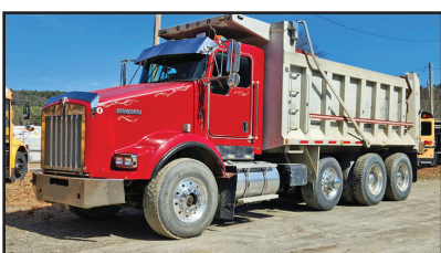
2005 T800 KENWORTH 18' Alum. Dump. C13 Cat @470 HP, 8LL, 20,20,46 Axles, 83,480 GVWR, One Chute, Air Ride, New Brakes, $64,500