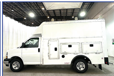
2025 3500 SERVICE VAN. 10' Rockport Body, 3 Bar Rack, V8 Gas, Pass Thru Door, #C83846 $61,710