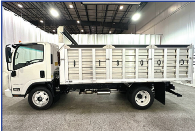
2025 4500HG ALUMINUM RACK DUMP. Landscaper Spec, 14' Body, V8 Gas, Auto, 14,500 GVW, #C82505 $71,550