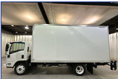
2025 4500HG FREIGHT HAULER. 16' 6" Body, Liftgate, Two Rows E-Trac, V8 Gas, 14,500 GVW #C82572 $77,685