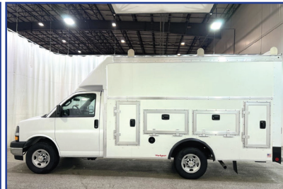
2025 3500 UTILITY. 12' Rockport Body, 3 Bar Ladder Rack, V8 Gas, Pass Thru Door, #C83899 $62,412