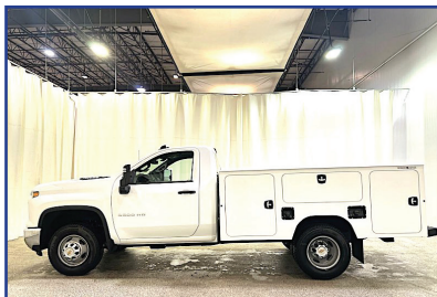
2025 3500HD ALUMINUM SERVICE. 4X4, 9'6" Duramag Body, V8 Gas, Step Bumper, DRW, #C83555 $63,495