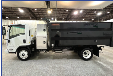
2024 4500HG LANDSCAPE DUMP. Curb Side Door, I-Pac, 12' Body, V8 Gas, Auto, 14,500 GVW, #C81922 $68,140