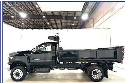
2024 5500HD DUMP. 4X4, Diesel, 19,500 GVW, Polish Alum Wheels, Tool Box, #C82281 $71,450