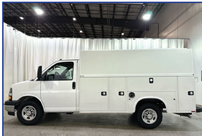
2025 3500 SERVICE. Knapheide Body, V8 Gas, Pass Thru Door, Step Bumper, Tow Hitch, #C84104 $66,985