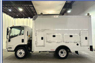
2025 4500HG UTILITY. 12' Rockport Body, 3 Bar Ladder Rack, V8 Gas, Auto, #C82867 $74,745