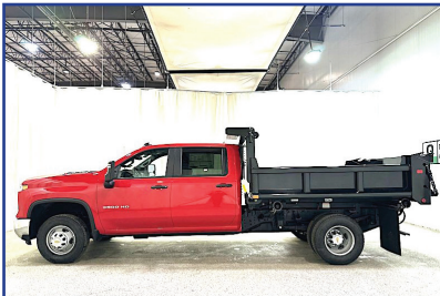
2025 3500HD DUMP. Crew Cab, 4X4, 9' Body, V8 Gas, Load Cover, Pintle Hitch, #C84129 $68,495