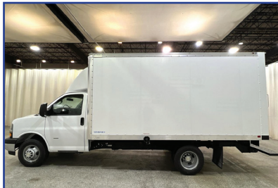
2025 3500 FREIGHT HAULER. 12' Body, Pull Out Ramp, Step Bumper, Roll Up Door, Pass Thru Door, #C83972 $69,950