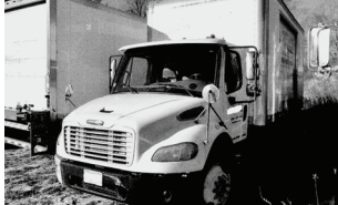
2006 Service Truck. 18' Morgan, Lift Gate, 9' Curb Door, Tote Pump, Nept 1.5" Meter, New Block 2022 CAT C7, Auto, 26k GVW, 338k Miles, $16,000