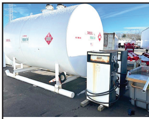
2002 5000 GALLON DW DIESEL TANK. With Two Suction Pumps And Hardware, Excellent Condition, $24,500. FOB Boston