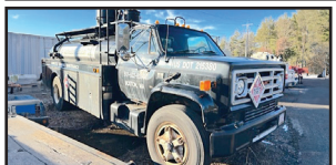
Site Or Storage * Fast Flow 1985 GMC Liquid Test Measurement Truck. Detroit, 5+2 Trans, 1500/500 Gal Compts Testing Top & Bottom All Liquids, 3" Pump, Good Cond. $15,000