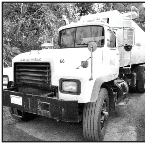
2001 MACK RD688S T/A WATER TANK. 183K Miles, AC, Auto, 5000 Gal, Air Ride, $19,000