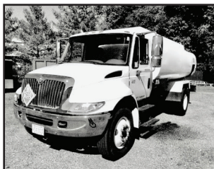
2007 IHT 4400 Tanker. 2 Compartment 2000/800, Auto, DT-466, 156K Miles, 4E Neptune Meter, $49,000