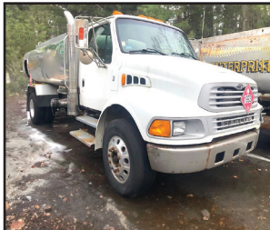
2004 Sterling Boston Tank. 2700 Gal, 137k Miles, CAT 3126, 6 Spd, L/C M71 Meter, $13,900