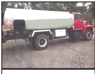
1987 Ford LN8000 Tech Weld. 3,150 Gal.. 225k Miles, Auto, New Tires, New Brakes, Good Cond., $10,900