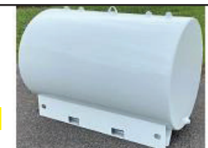
HIGHLAND IN STOCK NEW.1000 Gal 2 Wall Skid Tanks. 10-GA, CALL