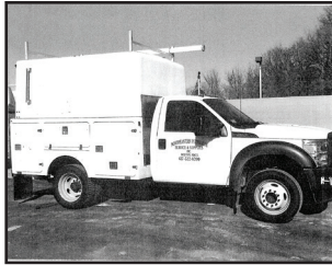
2012 Ford F450 Service Body. V10 Gas, Auto, 2WD, Captain Seats, 150K Miles, 9' Fiberglass Body, $15,000