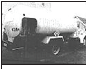
1996 Kenworth T300 Boston Steel. 2 Compt. 1,000 Gal & 1,600, Cummins, 6 Spd, Neptune Meter, Hannay Reel, High Speed Pumping, 298k Miles, $19,000.