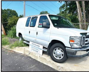
2012 Ford E250. Bin Pkg, V8 Gas, Auto, 112k Miles, Fleet Maintained, $17,000