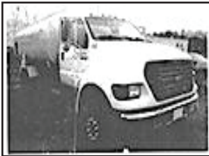
2000 Ford F750 Boston Steel 2,700 Gal. 1 Compt. CAT 2156, 7 Spd, V-Root 2" L/C M-7 Printer, 126k Miles, $17,900