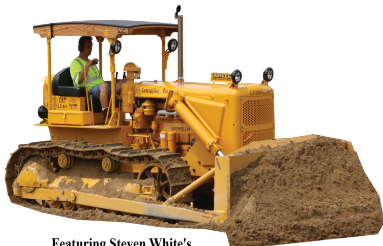
Featuring Steven White's 1956 Caterpillar D6-9U Dozer!!

Come and watch as old construction equipment performs a variety of tasks including digging, dozing, grading, shoveling, hauling, the possibilities are endless!