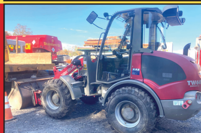
2020 TAKEUCHI TW60 SERIES 2 WHEEL LOADER LESS THAN 400 HOURS, ONE OWNER. $65,000