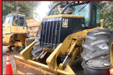
CAT 525 GRAPPLE SKIDDER, LOW HOURS ON MOTOR, $32,500