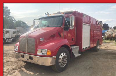
2006 KENWORTH T300 AUTO TRANS, CAT MOTOR, 350K MILES, A/C, BACK UP CAM, MECHANIC BODY WITH GREASER, PTO AIR COMPRESSOR, DIESEL MOTOR, HYD AND WASTE OIL TANKS, 3203PRX AUTO CRANE. $117,500