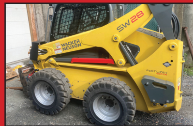
2016 WACKER NEUSON SW28 SKID STEER, LIKE NEW, VERY LOW HOURS, GP BUCKET HIGH FLOW, FERTILIZER EDITION. $47,500