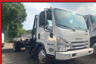
(2) 2022 IZUZU NRR CAR CARRIER TILT BODY, IZUZU DIESEL ENGINES, JUST OVER 50K MILES, AUTO TRANS, SUPER CLEAN TRUCKS. $67,500