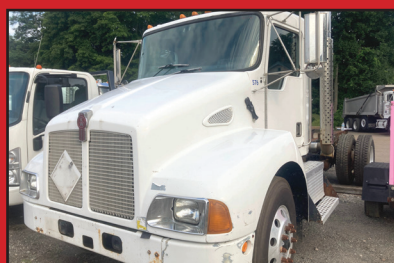
2002 KENWORTH T300 CAB AND CHASSIS, AIR RIDE, 6 SPEED, CUMMINS ENGINE. $17,500