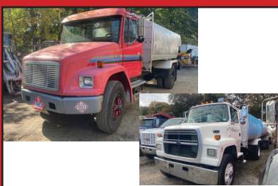
(1)1993 FREIGHTLINER FL 70 & (1) 1993 FORD L8000 FUEL TRUCKS. METERS AND HOSE REELS, WOULD MAKE GREAT WATER TRUCKS. $9750 EACH