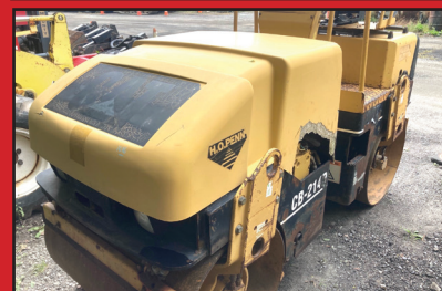
CAT CB214D DOUBLE DRUM ROLLER, CLOCK READS 1861HRS, 13,500