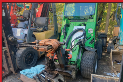
2020 AVANT 635 OPTI-DRIVE WITH GRAPPLE AND BLADE 1062 HOURS ONE OWNER. $42,500