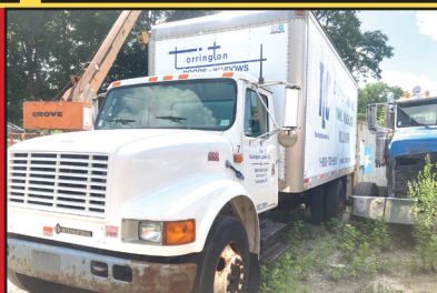
(2) 2000 INTERNATIONAL. 5 Speed Trans, DT, 210 HP, 20' Box, Curtain Door, 200K Miles, Bud Wheels, Spring Rear Suspension, $7,500