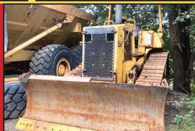
CAT D4H HIGH TRACK DOZER. GOOD BOTTOM, REPACKED CYLINDERS, NEW CUTTING EDGE. $27,500