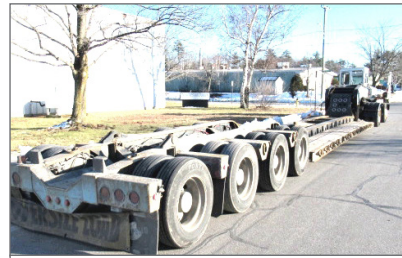
2016 FONTAINE MAG60 DSR. 28' Deck, 3 Axles With Pin On 4th, 2 Lift Axles, 60" Axle Spacings, Set Up For Gooseneck Extension To 183", One Owner, Original Paint, Call For More Information.