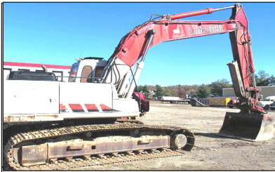
2005 LINKBELT 240 LX EXCAVATOR. With Hyd Thumb, Quick Disconnect, Digging Bucket, Hyd Wrist O Twist Bucket, Frost Tooth Bucket, Root Rake Bucket, 9000 Hours, Working Daily One Owner, Call For More Information.