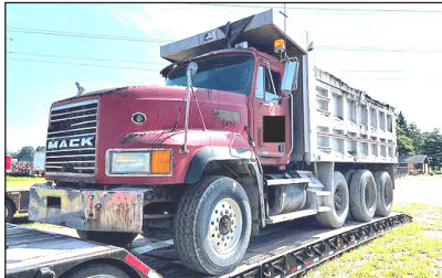
2000 MACK CL713. 17' Steel Body, 460 HP, 18 Speed, 46 Rears, 18 Fronts, 20 Pusher Axle, One Owner Bought New, Has Small Fuel Issue. Call For More Information.

293 NORTH - EXIT 2 - LEFT ONTO BROWN AVE - RIGHT ONTO WINSTON ST.- LEFT ONTO GAY ST. 300 GAY STREET ON THE RIGHT