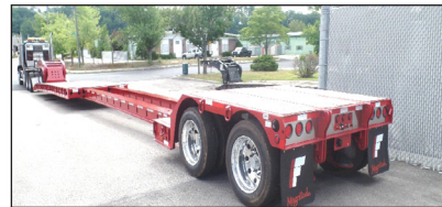
IN STOCK - 2025 FONTAINE LXTN40. 40 Ton Extendable, 34' Closed - 60' Open. Also Available 29' Closed - 50' Open. Tandem Axle, Set Up For 3rd, Air Ride, Non Ground Bearing, 102" Swing Clearance, 20" Deck Height, Alum Wheels. In Stock, No Waiting. Available In Manchester NH And At The Factory In Springfield AL. 3rd And 4th Axles Available. Call For More Information.