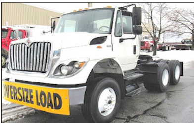
2011 INTERNATIONAL 7400 WORKSTAR. DT570, 12,000 Original Miles, Allison Automatic Transmission, Air Ride, Former Florida Municipality Truck, New Tires, Excellent Shape. Call For More Information.