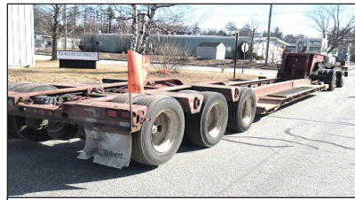
1999 TALBERT DSR TRAILER. 25' Steel Deck, 102" Wide, Low Pro Tires, Air Ride, Lift Axle, Non-Ground Bearing, Rear Wheel Pockets, Good Rubber, Working Daily. Call For More Information.