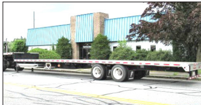
2017 FONTAINE INFINITY. Combo Stepdeck Trailer Model HCITX22RSA, 53 X 102, With Ramp System, Like New Condition, Tandem Axle, Rear Slide, 80,000 Lb. Capacity, Air Ride, Container Locks, Chain Tie Downs, Winches, Approx 4,000 Original Miles, 22.5 Tires. Call For More Information.