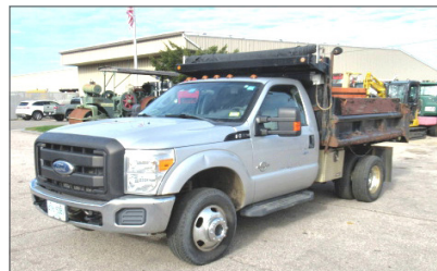
2011 FORD F350. Power Stroke Diesel, Automatic, Dual Wheels, One Owner, 123,000 Miles, Call For More Information