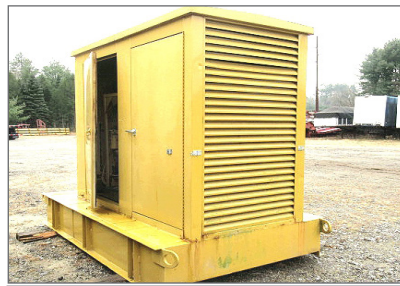
CAT 3208 GENERATOR. 175 KW, 700 Hours, 3 Phase, Call For More Information.