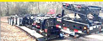
NEW MODEL - IN STOCK NO WAITING. Beat The Price Increase. Fontaine Magnitude 65 2+3+2 Capable, 28' Drop Side Rail Deck, 3 Axle, Set Up For 4 Axle, 14.75" Deck Height, 102" Wide, 60.5" Axle Spacing, Eq2 Spreader Bar With Intermediate Axle, Hydraulic Removable, Non Ground Bearing With 2 Pin Position At 114" And 102", Triple Cylinder, 70" Hydraulic Flip Box, Heavy Duty Snap In Outriggers, D-Rings, Alum Wheels, 275/70R X 22.5 Tires. Call For More Information.