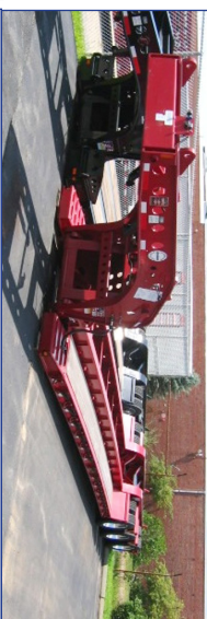
NEW 2025 FONTAINE 55 TON , Drop Side Rail, Tri Axle, Air Ride, Set Up For 4TH, Non Ground Bearing, Led Lights, Aluminum Wheels, Strobe Lights, Loaded, In Stock No Waiting. Call For More Information