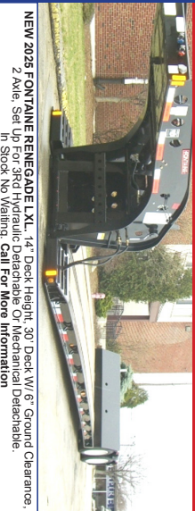
NEW 2025 FONTAINE RENECADE LXL , 14" Deck Height, 30' Deck W/6" Ground Clearance, 2 Axle, Set Up For 3rd Hydraulic Detachable Or Mechanical Detachable. In Stock No Waiting. Call For More Information