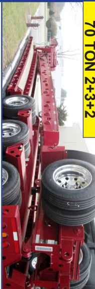
2025 FONTAINE 704/2+3+2 DROP SIDE RAIL , 4 Axle, 28' Deck, Hydraulic Detachable, In Stock, No Waiting, Non Ground Bearing, 102' Wide 65' Flip Box, Spreader Bar And 352J, Jeep, Alum Wheels, 275/70S X 22.5 Tires, 28' Beam Deck Available. Call For More Information.