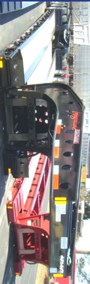
NEW 2025 FONTAINE SPECIALIZED MAGNITUDE 55L , Tri Axle, Air Ride, Set Up Or 4th Axle, Non Ground Bearing, 25' Deck, Led Lights, Aluminum Wheels, Strobe Light Package, Lift On 3rd Axle, 2 Pin Position, Loaded, In Stock No Waiting. Call For More Information

WE RENT WALKING FLOORS • DUMPS • HIGH FLAT EXTENDABLES • JEEPS