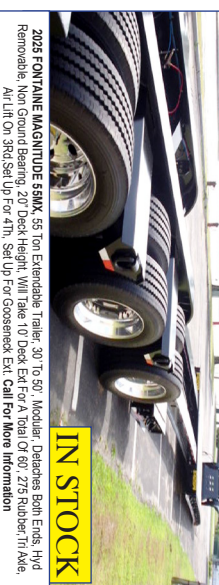
2025 FONTAINE MAGNITUDE 55MX , 55 Ton Extendable Trailer, 30' To 50', Modular, Detaches Both Ends, Hyd Removable, Non Ground Bearing, 20' Deck Height, Will Take 10' Deck Ext For A Total Of 60', 275 Rubber Tri Axle, Air Lift On 3rd, Set Up For 4th, Set Up For Gooseneck Ext. Call For More Information

WE RENT WALKING FLOORS • DUMPS • HIGH FLAT EXTENDABLES • JEEPS