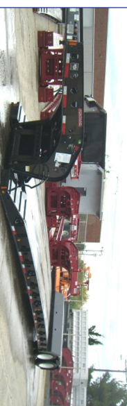
2025 FONTAINE 35 TON LOWBED , Air Ride, Tandem Axle, 29FT Flat Level Deck, Non Ground Bearing, Hwy Goose Neck, Set Up For Future 3rd Axle, In Stock. Call For More Information

WE RENT STINGERS • SPREADER BARS • DOUBLE DROP EXTENSIBLES TRAILERS