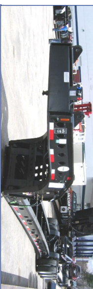
NEW 2025 SPECIALIZED 55 TON BEAM TRAILER , 3+1 Modular, NGB, Detach Both Ends, Tri Axle, Air Ride, Lift On 3rd, Set Up 4th, Set Up For Gooseneck Extension, Call For More Information

Trades Welcome • Financing Available • www.josephequipment.com