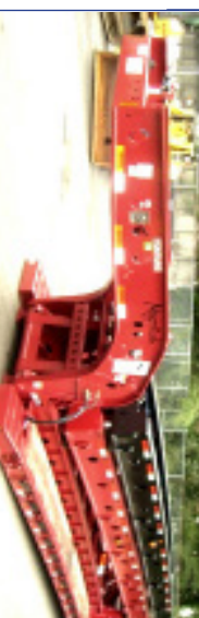
2025 FONTAINE 55H MODULAR DSR , Beam Deck Also Available, Tri Axle, 60' Axle Spacing, Hydraulic Removable, Non Ground Bearing, Set Up For Gooseneck Ext, Spreader Bar And 4TH Axle Flip, Air Ride, Alum Wheels, 22.5 Rubber, Call For More Information.