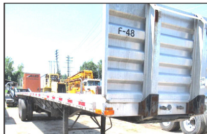
2006 TRANSCRAFT EAGLE II. High Flat, 48 X 102, Combo, Headboard, Slider, Alum Wheels, 2 Axle, 1 Owner. (2 Available To Choose From). Call For More Information.