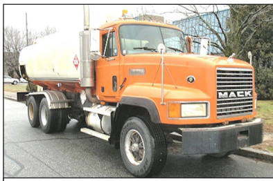
1996 MACK CL 713, 350 MACK. 13 Speed Mack, 46K Rears, 4,100 Gallon Two Compartment Tank, Remtec Inc Steel Tank, 1100 X 24.5 Rubber, 270,000 Original Miles. Call For More Information.