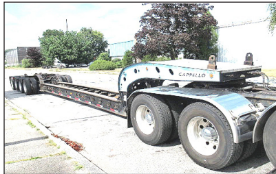
2007 LIDDELL 50 TON BEAM TRAILER. 4 Axle, Lift On Third, 4th Axle Flip, Detaches Both Ends, 28' Deck, NGB, Excellent Shape, One Owner. Call For More Information.