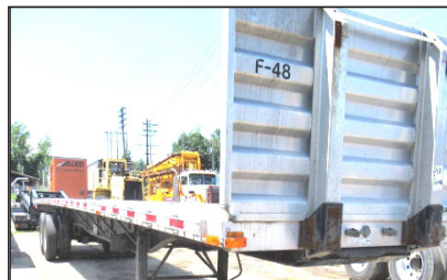
2006 TRANSCRAFT EAGLE II. High Flat, 48 X 102, Combo, Headboard, Slider, Alum Wheels, 2 Axle, 1 Owner. (2 Available To Choose From). Call For More Information.