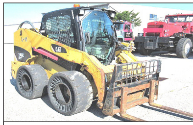
2011 CATERPILLAR 246C XPS. Skidsteer, 2 Speed, Full Cab, A/C, Cushion Tires, Forks And Bucket, Extra Counterweights, 4,000 Hours, One Owner, Original Paint. Call For More Information.