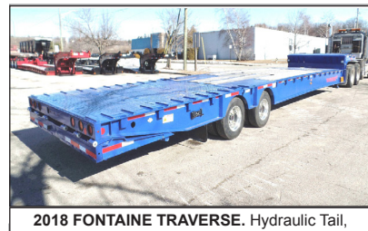
2018 FONTAINE TRAVERSE. Hydraulic Tail, Tandem Axle, Hydraulic Upper, Currently Being Sandblasted And Painted, One Owner, Winch, Remote Control, Weigh Scale, NAP Call For More Information.