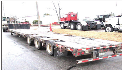
2014 MANAC TRI AXLE EXTENDABLE STEP DECK. Extends 53' To 69', Low Deck Height, 17.5 Rubber, Air Ride, Excellent Shape, One Owner, Original Paint. Call For More Information.