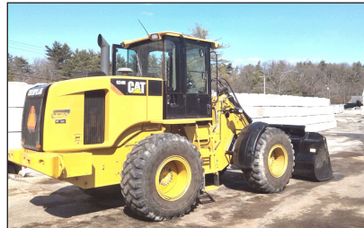
2009 CATERPILLAR 924H WHEEL LOADER. Quick Disconnect, New Motor From CAT With Paperwork, Very Good Condition, Call For More Information.