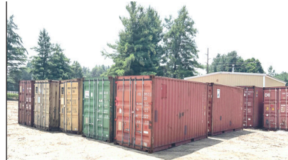
100 STORAGE CONTAINERS TO CHOOSE FROM. 20', 40' And 40' High Cube. Call For More Information.