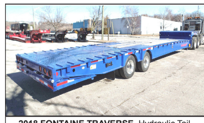
2018 FONTAINE TRAVERSE. Hydraulic Tail, Tandem Axle, Hydraulic Upper, Currently Being Sandblasted And Painted, One Owner, Winch, Remote Control, Weigh Scale, NAP Call For More Information.