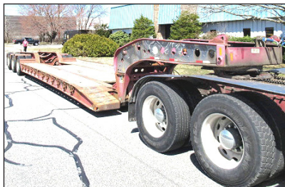
2004 FONTAINE TH55 TRAILER. 25' FLD, Air Ride, Tri Axle, Lift On Third, 275 Rubber, Alum Wheels, Original Paint, One Owner, Very Good Condition. Call For More Information.