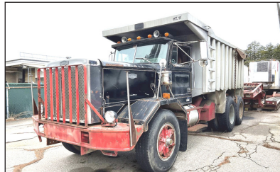
1987 AUTOCAR DK64. Tandem Dump With J & J Alum Rock Body, Dual Piston, Ledge Gate, Cummins Power, 8 Spd, 58K Rears, 24" Rubber, Spring Ride. Call For More Information.