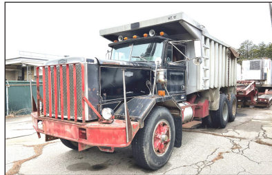
1987 AUTOCAR DK64. Tandem Dump With J & J Alum Rock Body, Dual Piston, Ledge Gate, Cummins Power, 8 Spd, 58K Rears, 24" Rubber, Spring Ride. Call For More Information.