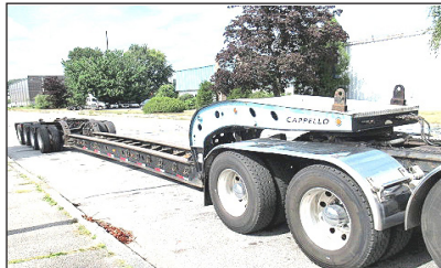
2007 LIDDELL 50 TON BEAM TRAILER. 4 Axle, Lift On Third, 4th Axle Flip, Detaches Both Ends, 28' Deck, NGB, Excellent Shape, One Owner. Call For More Information.