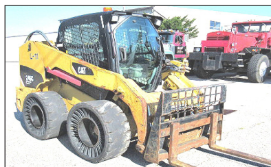
2011 CATERPILLAR 246C XPS. Skidsteer, 2 Speed, Full Cab, A/C, Cushion Tires, Forks And Bucket, Extra Counterweights, 4,000 Hours, One Owner, Original Paint. Call For More Information.