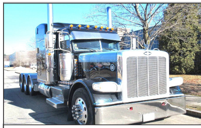
2019 PETERBILT 389. 605 Cummins Power, 18 Speed, 4 Axle, 46K Rears, Air Ride, 300" Wheel Base, Headache Rack, Full Fenders, 60" Bunk, Loaded, Call For More Information.