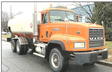
1996 MACK CL 713, 350 MACK. 13 Speed Mack, 46K Rears, 4,100 Gallon Two Compartment Tank, Remtec Inc Steel Tank, 1100 X 24.5 Rubber, 270,000 Original Miles. Call For More Information.