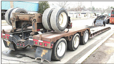
2012 55 TON FONTAINE. (2 Available To Choose From 2009 And 2012), Tri Axle With Pin On 4 Axle, 25 Foot Deck, Powerpack, Full Fenders, Air Ride, Texas Trailer- Rust Free, Call For More Information.

293 NORTH - EXIT 2 - LEFT ONTO BROWN AVE - RIGHT ONTO WINSTON ST.- LEFT ONTO GAY ST. 300 GAY STREET ON THE RIGHT