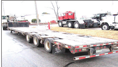
2014 MANAC TRI AXLE EXTENDABLE STEP DECK. Extends 53' To 69', Low Deck Height, 17.5 Rubber, Air Ride, Excellent Shape, One Owner, Original Paint. Call For More Information.