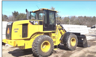
2009 CATERPILLAR 924H WHEEL LOADER. Quick Disconnect, New Motor From CAT With Paperwork, Very Good Condition, Call For More Information.