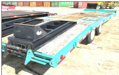
2008 ROGERS 20 TON TAG ALONG TRAILER. Model 20XXL, Tandem Axle, Rear Ramps, Pintle Hook, 17.5 Rubber, 48,000 GVW, Clean, Straight, Excellent Condition. Call For More Information.