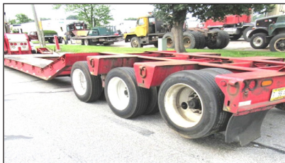
2003 TALBERT 50 TON 9 WIDE TRI AXLE PAVER STYLE TRAILER. Non-Ground Bearing, Three Axle, Air Ride, Lift On Third, 25 1/2 Foot Long Lower Deck, 5 Foot Slope, Covered Back, Excellent Shape, One Owner, Call For More Information.