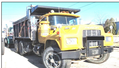
1984 MACK RD686SX. 300, 6 Speed, 58K Rears, 14' Body, One Owner, 1100 X 24.5 Rubber, 250K Original Miles, Jake, Brake, A/C, Excellent Shape. Call For More Information.