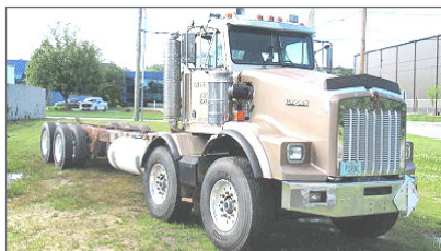
1997 KENWORTH T800. Twin Steer Wide Nose, 550 Cummins, 18 Speed, Long Wheel Base, 30' From Back Of Cab To End Of Frame, Newair Ride, Double Frame, 164,000 Original Miles, New Michelin Tires In Back. Call For More Information.