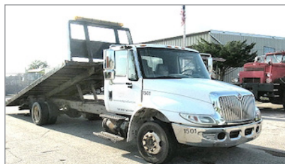
2003 INTERNATIONAL DURASTAR 4300. DT466 Motor, 6 Speed Transmission, 21' Chevron Body, Rebuilt Motor, A/C, P/S, Spring Ride, One Owner, Original Paint, Very Good Condition. Call For More Information.