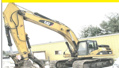
2009 CATERPILLAR 336D. 93 Hours On New Motor, New Swing Drive, 3rd Valve, Hydraulic Thumb, Excellent Shape. Call For More Information.