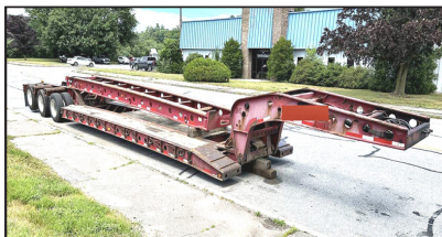
1998 FONTAINE, MODEL. 50 Ton, Detaches At Both Ends, 25' Flat Level Deck - 20" Loaded Deck Height, 25' Beam Deck Insert, 20" Loaded Deck Height, Non Ground Bearing, Air Ride, Boom Trough & Deck Cut Out, Lift Axle, Outriggers, Aluminum Wheels, Strobe Lights. Call For More Information.