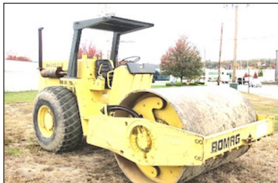
1996 BOMAG ROLLER. Model BW212D-2, 84" Drum Drive, 2400 Hours, Deutz Engine. Call For More Information.

293 NORTH - EXIT 2 - LEFT ONTO BROWN AVE - RIGHT ONTO WINSTON ST.- LEFT ONTO GAY ST. 300 GAY STREET ON THE RIGHT