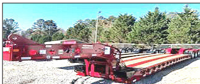
IN STOCK - 2025 FONTAINE MAGNITUDE 60HD-MX. Deck Extends From 30' To 51', 65 Ton When Closed, Built To Handle A 60 Ton Load With Ease, 30' Clear Deck Length Extends To 51', 22" Loaded Deck Height, 6" Ground Clearance, 7 Position Hydraulic Detachable Gooseneck, 7 Position Air Ride Tridem Bogle, 402 Jeep Ready, 36" And 83" Flip Box Ready, 60/90 Flip Axle Ready, EQ2 Spreader Bar Ready, Loaded. Call For More Information.