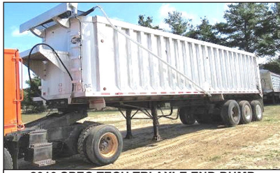
2010 SPEC TECH TRI AXLE END DUMP TRAILER. Alum Frame, Alum Tub, Spring Ride, 2 Way Gate, Liner And Cover, Ready To Work, Excellent Condition. Call For More Information.