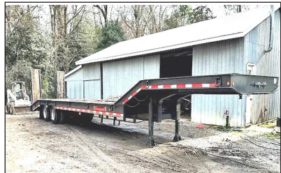
2018 RAMPANT 35 TON TRAILER. 48' W/Ramps, Excellent Shape, Call For More Information.