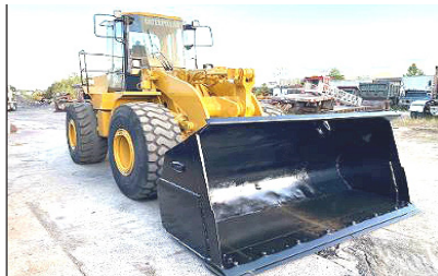
1997 CATERPILLAR 960F WHEEL LOADER. Sandblasted And Painted, New Decals, A/C, Scale, 23.5 X 25 Rubber, Bolt On Cutting Edge, Very Good Condition. Call For More Information.