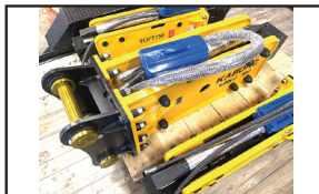
TOFT HYDRAULIC HAMMERS. Brand New, Three Available, Fits Caterpillar 312, 307, & 304 Size Machines $5,000.-$8,500