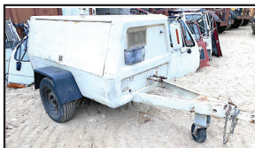
INGERSOLL-RAND 185 COMPRESSOR. Duetz Diesel Engine, Just Off The Job. $6,000