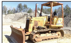
1988 CAT D-3C DOZER. 60% U/C, Runs Excellent, $19,500