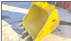
TOFT 42" HD EXCAVATOR BUCKET. Brand New, Fits Cat 315. $3,500