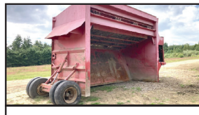
READ RD-150 SCREENER. John Deere Diesel Powered, 4" Top Deck, 3/4" Bottom Deck, $39,500