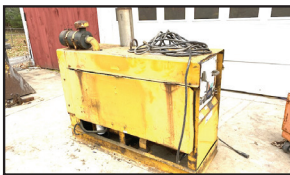
MILLER D-4 WELDER. Perkins Diesel, Runs And Welds Excellent. $3,500