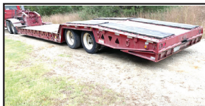
2006 TRAIL KING 35 TON DETACHABLE LOWBED. Hydraulic Tail, Winch, 8'6" Wide, 21' Deck, 8' Over Wheels, 8' Tail. $34,500