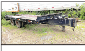
1980 ROGERS 20 TON TAG-A-LONG. Air Brakes, Very Clean, 96" Wide. $4,000