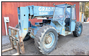
GRADALL 534B-9 EXTENDING BOOM FORKLIFT. Perkins Diesel, 4X4. $25,000