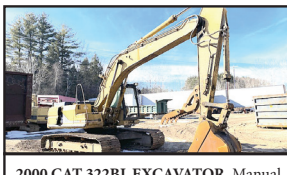
2000 CAT 322BL EXCAVATOR. Manual Thumb, Plumbed For Hammer, No Welds, Runs And Works Well. $37,500