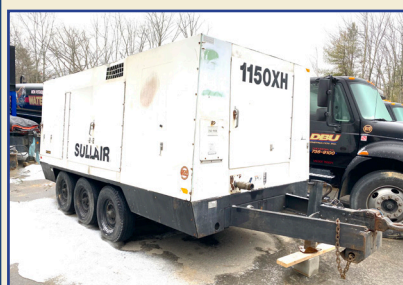
2004 SULLIVAN 1150XH.

Road Liner Pads, JRB Coupler, JRB Hydraulic Tilt Bucket, Esco 42", Thumb, 2500 Hours, $99,500.