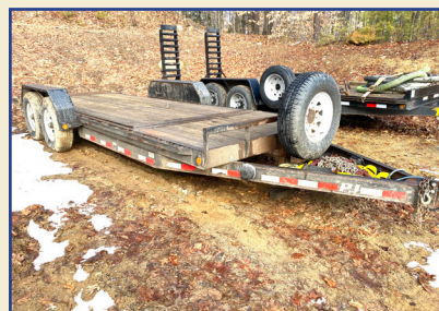
2012 PJ TILT TRAILER.