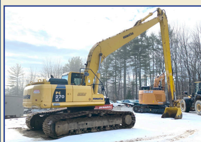
2006 KOMATSU PC270 LC 8.

With Long Reach Boom And Stick, Also Comes With Standard Boom And Stick, Plumbed, Esco 42", New Undercarriage, 6500 Hours, $99,500.