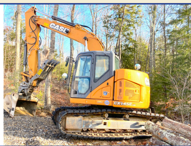
2016 CASE CX145C.

5k Hours, Very Clean Machine, Work Ready, $99,500.