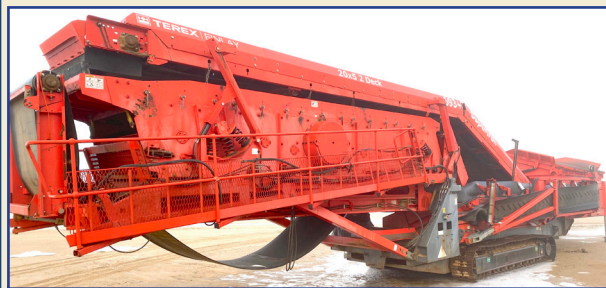
2012 FINLEY 693 PLUS.

5k Hours, Very Clean Machine, Work Ready, $99,500.