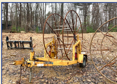
2006 KIEFER ICH.

Ledwell Water Tank System, 69k Miles, Automatic, $25,000