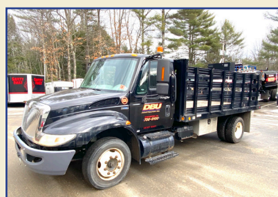
2009 INTERNATIONAL RACK BODY.

New Engine, Very Clean With A New Iron. $17,500.