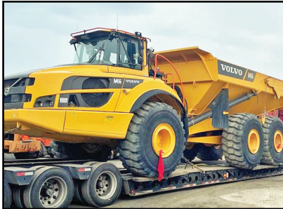
9358 2021 VOLVO A45G 6WD. 45 Ton, One Owner, Excellent Condition, 2,276 Hours, $599,500.