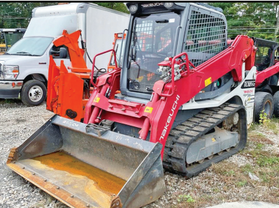
9388 2019 TAKEUCHI TL10V2. Coupler, Tracks, Cab, AC/Heat, Bucket, 1,085 Hours, $48,800.