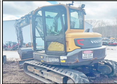
9321 2015 VOLVO ECR88D. Coupler, 3rd Valve, 30" Dig Bucket, 48" Static C/Up Bucket, Hyd Thumb, Blade, Rubber Tracks, 6,920 Hours, $55,500.