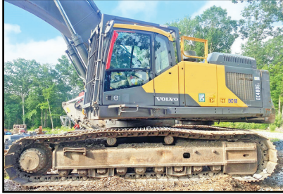
9356 2015 VOLVO EC480EL. 60" Pin On Digging Bucket, Good Bottom, Full Cab, AC/Heat, 7K Hours, $129,500.