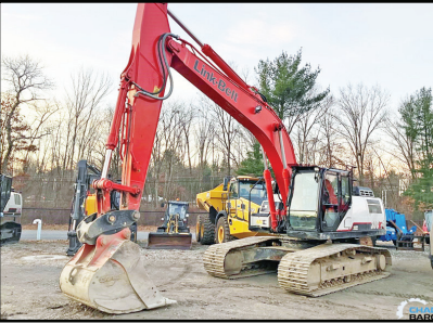
9438 2021 LINK-BELT 300 X4. Coupler, 3rd Valve, 36" Digging Bucket, Full Cab, AC, 1,156 Hours, $187,500.