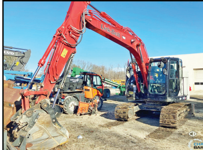
9437 2020 LINK-BELT 145 X4 DZ SPIN ACE. Coupler 3rd Valve, 36" Digging Bucket, Hyd Thumb, Full Cab, AC, 2,223 Hours, $135,500.