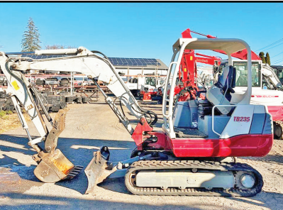
9348 2014 TAKEUCHI TB235. COUPLER, 3RD VALVE, 24" DIGGING BUCKET, BLADE RUBBER TRACKS. 1,655 Hours, $28,500.