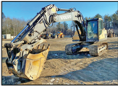
9416 2015 VOLVO EC160DL. Coupler, 3rd Valve, 36" Digging Bucket, Hyd. Thumb, 4,773 Hours, $84,500.