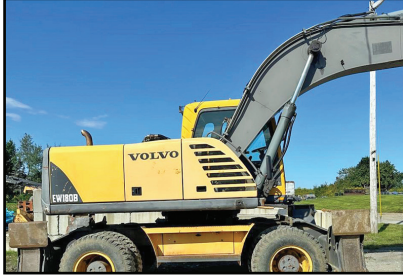
9368 2004 VOLVO EW180B. Coupler, 3rd Valve, 36" Digging Bucket, 63" Hyd. Tilt Bucket, Full Cab, AC/Heat, $55,000.