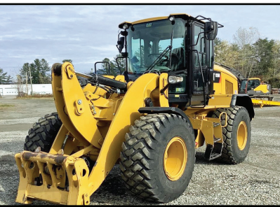
9392 2018 CATERPILLAR 926M. Coupler 3rd Valve, Full Cab, AC/Heat, 4,288 Hours, $112,500.