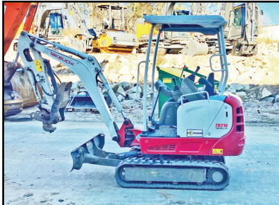
9447 2019 TAKEUCHI TB216. Coupler, 3rd Valve, Rubber Tracks, 1,498 Hours, $19,500.