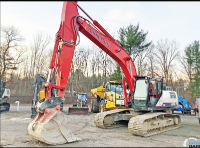
9438 2021 LINK-BELT 300 X4. Coupler, 3rd Valve, 36" Digging Bucket, Full Cab, AC, 1,156 Hours, $187,500.