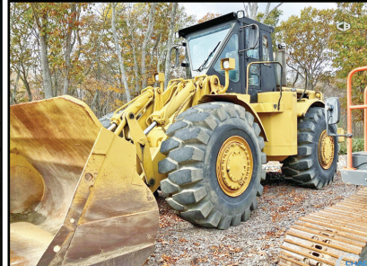
9373 1975 CAT 988B. 90% Tires, Heater, Enclosed ROPS, $19,500.