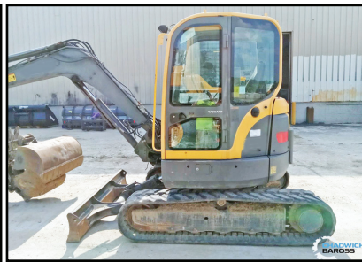
9350 2008 VOLVO ECR58. Coupler, 3rd Valve, 24" Dig Bucket, 48" Hyd Tilt Bucket, Hyd Thumb, Blade, Rubber Tracks, Full Cab, 3548 Hours, $44,500.