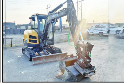
9318 2022 VOLVO EC35D. Full Steelwrist Rotator System With 2 Buckets, Rubber Tracks, Blade, 315 Hours, $112,500.