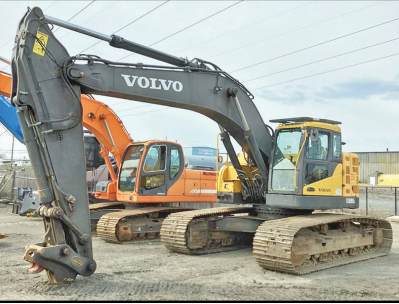
9320 2016 VOLVO ECR305CL. AC, Heat, Coupler, 3rd Valve, Full Cab, 5,670 Hours, $172,000.