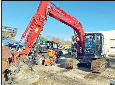
9437 2020 LINK-BELT 145 X4 DZ SPIN ACE. Coupler 3rd Valve, 36" Digging Bucket, Hyd Thumb, Full Cab, AC, 2,223 Hours, $135,500.