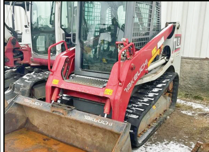
9452 2019 TAKEUCHI TL8. Coupler, 3rd Valve, GP Bucket, 2,800 Hours, $32,500.