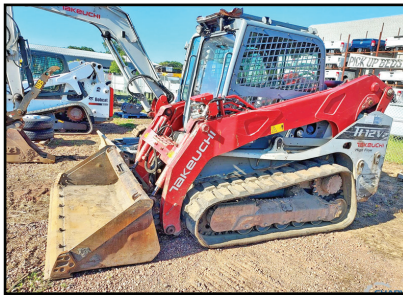
9377 2016 TAKEUCHI TL12V2. Coupler 3rd Valve, GP Bucket, Rubber Tracks, 2,697 Hours, $45,500.