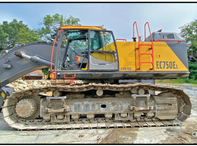
9355 2021 VOLVO EC750EL. 60" Digging Bucket, 3rd Valve, Full Cab, Heat/AC, Radio, 3,846 Hours, $569,500.