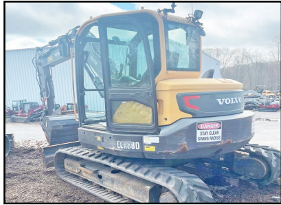
9321 2015 VOLVO ECR88D. Coupler, 3rd Valve, 30" Dig Bucket, 48" Static C/Up Bucket, Hyd Thumb, Blade, Rubber Tracks, 6,920 Hours, $55,500.