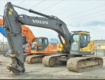
9320 2016 VOLVO ECR305CL. AC, Heat, Coupler, 3rd Valve, Full Cab, 5,670 Hours, $172,000.

Westbrook, ME | Bangor, ME | Caribou, ME | Concord, NH | Lancaster, NH Chelmsford, MA | Oxford, CT | South Windsor, CT | West Warwick, RI