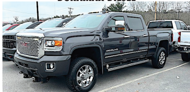
2016 K3500 DENALI DURAMAX DIESEL

ALL THE DENALI OPTIONS. ONLY 67,000 MILES. #W57