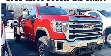
2022 C2500 DOUBLE CAB UTILITY

10,000 GVW, CONV. PKG., TRAILER BRAKE. #W30