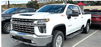
2020 K3500 HIGH COUNTRY DURAMAX DIESEL

ONE OWNER SOLD NEW BY US WITH ONLY 27,000 MILES. #V259