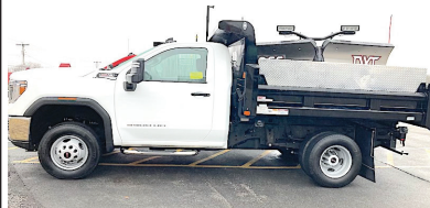
2020 K3500 DUMP TRUCK

14,000 GVW NICELY EQUIPPED W/ ONLY 13,000 MILES. ONE OWNER SOLD NEW BY US. #W53