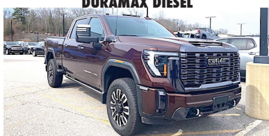
2024 K2500 DENALI ULTIMATE DURAMAX DIESEL

H.D. PRO SAFETY PKG., ADAPTIVE CRUISE, PLOW PREP.