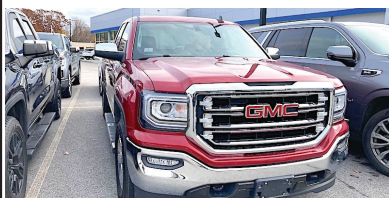
2018 K1500 DOUBLE CAB SLT

ONLY 26,000 MILES, ROLL-N-LOCK COVER. #V294