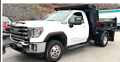
2022 K3500 DUMP TRUCK