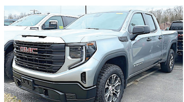
2023 K1500 DOUBLE CAB

V-8, CONV. PKG., X-31 OFF ROAD PKG., H.D. TRAILERING. ONLY 1,200 MILES. #W21