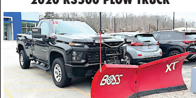
2020 K3500 PLOW TRUCK

CONV. PKG., Z71 SUSP., PLOW PREP., ONLY 25,000 MILES. #V18