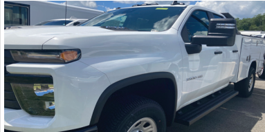
2024 K2500 CREW CAB UTILITY

PLOW PREP., CONV. PKG., TRAILER HITCH AND BRAKE. #24174H