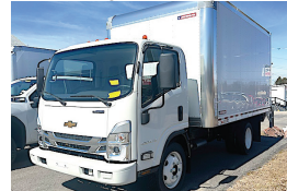
2024 LCF 4500 14' BOX + LIFT GATE

14,500 GVW, POWER MIRRORS, KEYLESS ENTRY, 14' ALUM. BOX, 2500# LIFT-GATE.