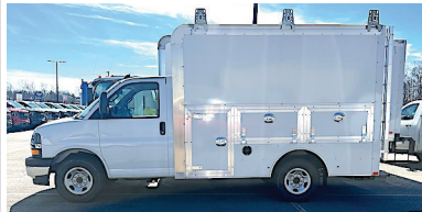
2025 DURACUBE MAX 10'

9,900 GVW, ELEC. BODY LOCKS, LADDER RACKS, SHELVING. #25141H