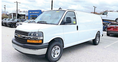
2025 EXPRESS ONE TON EXTENDED VAN

9900 GVW, V-8, TRAILER PKG., ALL THE OPTIONS. #25422H