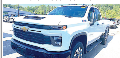
2025 K2500 DOUBLE CAB

CUSTOM VALUE PKG., SPRAY LINER, PLOW PREP. #25341H