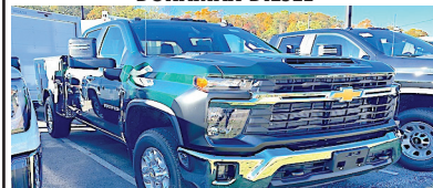
2025 K3500 LT CREW CAB UTILITY DURAMAX DIESEL

DARK GREEN METALLIC, BUCKET SEATS, REMOTE START, HEATED SEATS.