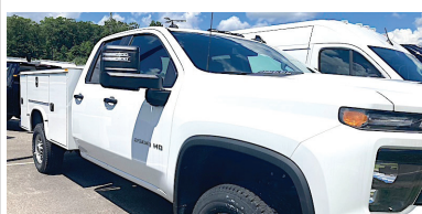
2025 K2500 DOUBLE CAB UTILITY