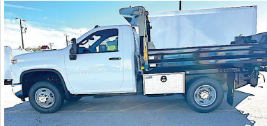
2025 K3500 DUMP TRUCK DURAMAX DIESEL

14,000 GVE, PLOW PREP., HITCH, COVER, CONV. PKG. #25411H