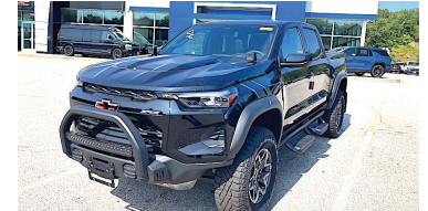
2025 COLORADO ZR2

FULL OFF-ROAD SPECS. INCLUDES LIGHT BAR, SHOCKS, STEPS, SUNROOF. #25385H