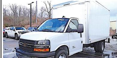
2024 4500 14' BOX

14,200 GVW, FANCY CHASSIS SPECS, TRANSLUCENT ROOF, RAMP, TIE-DOWN HOOKS. #24409H