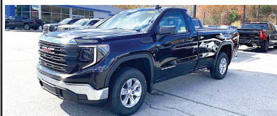
2026 K1500 8' BED

V-8, NICELY EQUIPPED. #26061G SALE PRICE INCLUDED GM TRADE-IN REBATE.