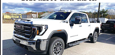
2026 K2500 CREW CAB SLT

SLT CONV. PKG., SPRAY LINER, PREFERRED PKG., HD SAFETY PKG., PLOW PREP. #26055G