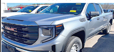
2026 K1500 DOUBLE CAB

V-8, PRO VALUE PKG., POWER SEAT, SPRAY LINER. PRICE INCLUDES GM TRADE-IN REBATE. #26109G