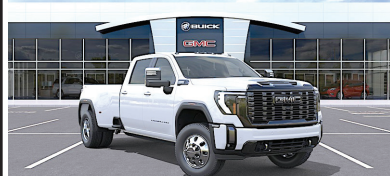
2026 K3500 DENALI DUALY DURAMAX DIESEL