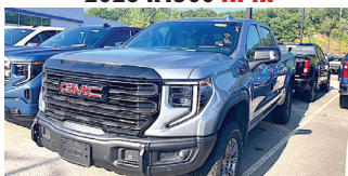
2026 K1500 AT4X

6.2L V-8, ACTIVE EXHAUST, KICKER TAILGATE AUDIO SYSTEM. #26019G