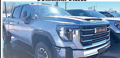
2026 K2500 CREW CAB SLT DURAMAX DIESEL