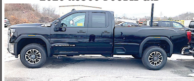
2026 K3500 DOUBLE CAB

CONV. PKG., SPRAY LINER, ALUM. WHEELS, PLOW PREP., ASSIST STEPS, X-31 OFF ROAD SUSP. #26084G