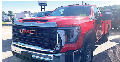
2025 K2500 UTILITY