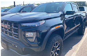
2026 CANYON AT4X