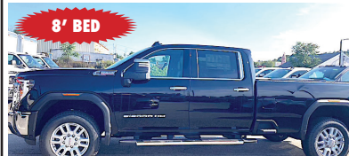
2024 K3500 CREWCAB SLT DURAMAX DIESEL

8' BED SLT PREMIUM PKG., X-31 OFF ROAD PKG. #24219G