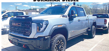
2026 K2500 AT4X DURAMAX DIESEL