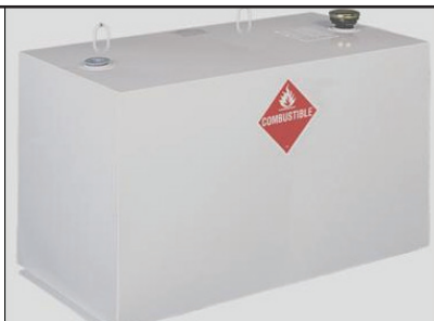
TRANSFER TANK & PUMP. Made In USA, 12 Ft Hose, Nozzle Gun, 15 gpm, In Stock – We Ship