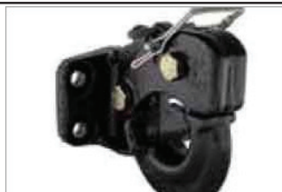
15 Ton Pintle Hook $89 – WE SHIP