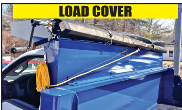
7' X 12' Mesh tarp & Hardware Kit $269