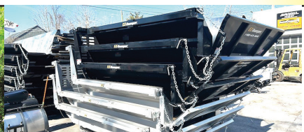
8 Ft & 6 Ft EZ SLIDE-IN DUMP BODY. Complete Head Board, Tarp, & Hoist.