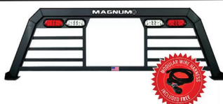
HEADACHE RACKS – Aluminum, USA Made, With Or Without Window Cut Out, Hi & Low Profiles, LED Light Options, Sport Series & Pro Series.