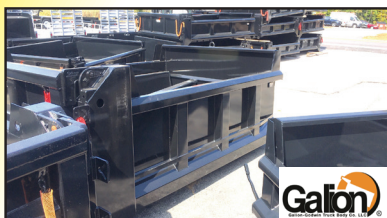
IN STOCK GALION DUMP BODIES. 8 Ft Thru 16 Ft. Call With Your Specs Today