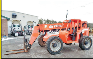
2014 SKY TRAK 6042: 3,560 Hours, 6K Lb Lift, 42 Ft Lift Height, 4x4, Orops, 4 Ft Rotate Forks, 4 Cyl Cummins Turbo, 85 HP, Tilt Body, Stk#FL355, $39,500