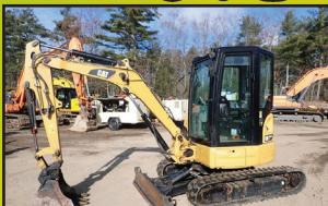
2017 CATERPILLAR 303.5E2 CR: 927 Hours, 24" Bucket, Cab W/ A/C, Auxiliary Hydraulics, Manual Coupler, Pattern Changer, 2 Speed, Swing Boom, 3 Cyl Cat, 70" Blade, 8.3K Lbs, stk#MX463, $43,500