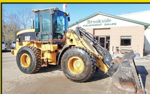
2001 CATERPILLAR 924G: 10,070 Hours, 2.5 Yard, Cab, Hydraulic Coupler W/ 3rd Valve, 6 Cyl Cat 3056 Turbo, 25K Lbs, Stk#LO540, $44,500