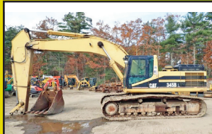
2004 CATERPILLAR 345BL-II: 19,116 Hours, A/C, Good U/C, 6 Cyl Cat Turbo, 101K Lbs, Stk#XC278, $49,500