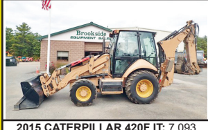
2015 CATERPILLAR 420F IT: 7,093 Hours, 4x4, X-Hoe, Cab W/ A/C, Front Hyd Coupler W/ 3rd Valve, Turbo, Power Shift, Ride Control, 18" Digging Bucket, Pilot Controls W/ Pattern Changer, Stk#BH518, $49,950