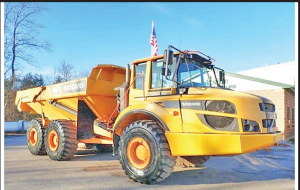
2016 VOLVO A30G: 4,250 Hours, 30 Ton, 6x6, Tailgate, A/C, 6 Cyl Volvo Turbo, stk#HT234, $209,950