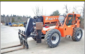
2017 SKYTRAK 10054: 6,877 Hours, 10K Lb Lift, 54 Ft Lift Height, 4x4, Cab W/ Heat & Air, Tilt Body, 5 Ft Forks, Outriggers, Foam Filled Rubber, stk#FL999, $59,500