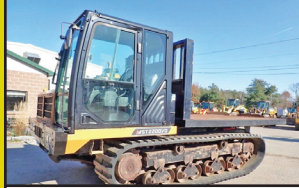
2017 MOROOKA MST2200VD: 2,552 Hours, 24K Lb Capacity, 9' X 12" Flatbed Dump, Cab, 250 HP, 32K Lbs, Stk#DU018, $59,500