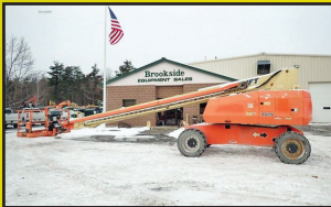
2011 JLG 800S: 4,326 Hours, 80 Ft Boom Lift, 4x4, 8 Ft Basket, 3-Phase Skypower, 4 Cyl Deutz Diesel, Stk#AE321, $34,500