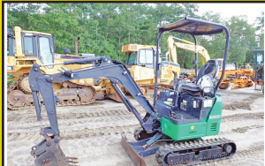
2017 JOHN DEERE 17G: 1,552 Hours, 12" Bucket, Orops, 2-Way Aux Hyd, 50" Blade, Manual Coupler, 2 Speed, Swing Boom, Extendable Tracks, 3 Cyl Yanmar, 3.8K Lbs, stk#MX761, $16,500