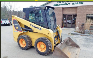
2015 YANMAR S190R: 1,226 Hours, 1900 Lb Lift, Cab, 4 Cyl Yanmar, 68 HP, Joystick Controls, Aux Hyd, Good Rubber, 6.9K Lbs, Stk#SK705, $24,500