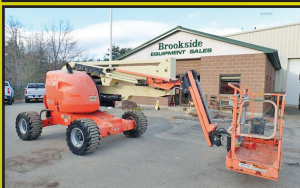
2014 JLG 450AJ II: 2,151 Hours, 45 Ft Knuckle Boom, 4x4, 6 Ft Basket, Jib, Skypower, 4 Cyl Deutz Diesel, Stk#AE411, $32,500