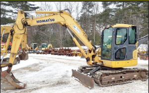
2011 KOMATSU PC88MR-8: 6,495 Hours, 23" Bucket, Cab, Auxiliary Hydraulics, Manual Wainroy Coupler, 92" Blade, Swing Boom, Roadliner Pads, 18.5K Lbs, Stk#XC655, $37,500