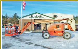
2008 JLG 600AJ: 4,275 Hours, 60 Ft Knuckle Boom Lift, 4x4, 8 Ft Basket, 4 Cyl Deutz Diesel, Jib, Stk#AE337, $27,500