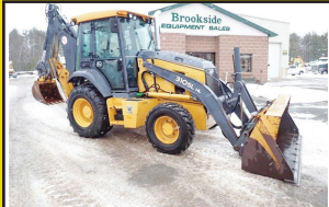
2015 JOHN DEERE 310SL HL: 1,954 Hours, 4x4, X-Hoe, Cab W/ AC, Front Hydraulic Coupler W/ 3rd Valve, Turbo, Power Shift, Ride Control, Pilot Controls, 24" Digging Bucket, Stk#BH016, $59,900