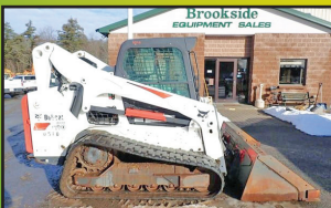
2019 BOBCAT T770: 1,765 Hours, 3475 Lb Lift, Cab W/ A/C, Hydraulic Coupler, Aux Hyd W/ High Flow, Joystick Controls, Variable 2 Speed, 10.6K Lbs, Stk#SK291, $49,500