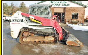
2016 TAKEUCHI TL12R2: 3,809 Hours, 2975 Lb Lift, Cab W/ A/C, Aux Hyd, Pilot Controls, Backup Camera, Hydraulic Coupler, Turbo, 84" Bucket, 12.6K Lbs, Stk#SK049, $39,500