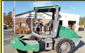
2015 HAMM H51: 1,551 Hours, 54" Smooth Single Drum, Drum Drive, Vibratory, 4 Cyl Kubota V3307 Turbo, 73 HP, 11.1K Lbs, Stk#CO240, $39,500