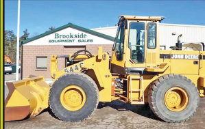
1996 JOHN DEERE 544G: 11,944 Hours, 2.5 Yard, Enclosed Cab, 6 Cyl John Deere Turbo, 30K Lbs, Stk#LO569, $34,500