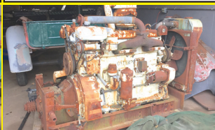
CATERPILLER POWER UNIT. It Runs, Make Offer