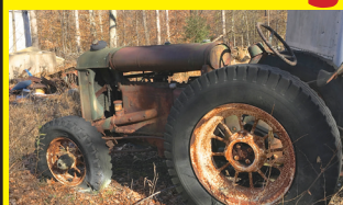
English Fordson Complete. Motor stuck. $750