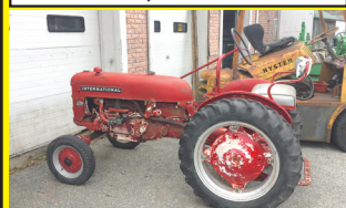
FARMALL CUB LOW BOY, Factory White, Make Offer