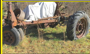
Very early regular tractor Have all parts to reassemble. BO