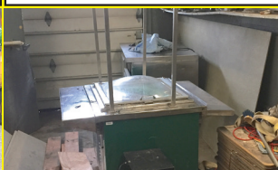
ICE CREAM CART Asking $575