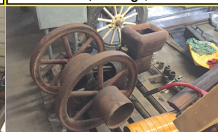
ONE LUNGER ENGINE. I Have 40! Make Offer