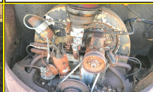
VW Beetle Parts only. Year unknown. Call for details