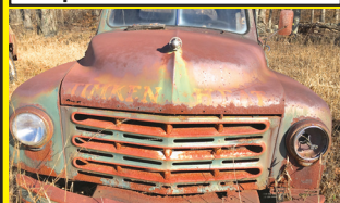
Studebaker pickup. Not running parts BO.