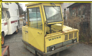
WAYNE SWEEPER 155, $750