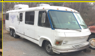
MOTOR HOME. Once Used By The Beatles, Drive It Home, Make Offer