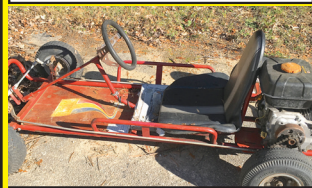
Go Cart with modified 6HP engine. Asking $500