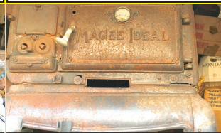
Magee Ideal Wood or coal kitchen stove. $500