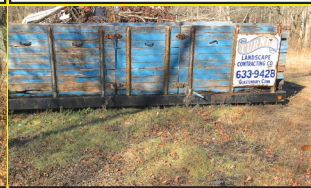
18' Rack Body. Steel deck. Good condition. BO