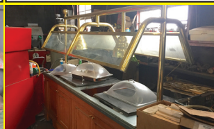
4 STATION BUFFET STATION ON WHEELS Asking $695