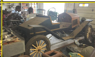
MODEL T SPEEDSTER $2,500