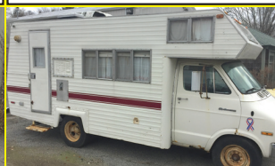
DODGE CAMPER, $1,000