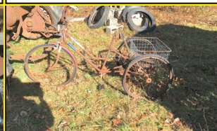
(3) 1940's Columbia bikes. BO