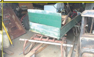
VINTAGE SLEIGH. One Or Two Horse, Asking $850