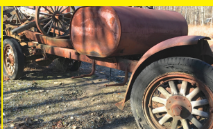
1930's GMC. Truck chassis with wheels. Make offer