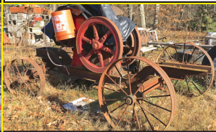
Hit & Miss Engine. Economy on original cart. $1,000