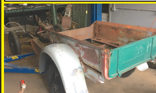
1930 MODEL A FORD PICK UP. Running Chassis, Call For Details