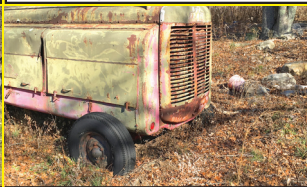
Military air compressor. TD 24 International engine. Easy restoration. Make offer