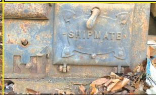
Shipmate coal stove. BO.