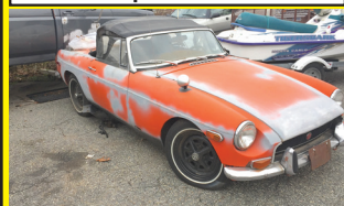
1970 MG CONVERTIBLE. Runs & Drives, Make Offer