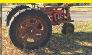
F12 Farmall Tractor $750