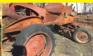
Allis Chalmers B. SN 209. Very collectible. $750