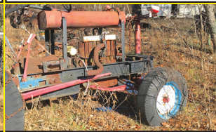
Doodle Bug. Chevrolet very early. Open valve engine BO