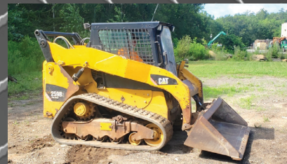
2017 SNORKEL TB60. Boom Lift, 60' Reach, Cummins, 5,600 Hours, 4x4, 2 Speed, Generator, # Way Entry Basket, New Chains & Hoses, Very Clean, Work Ready, $26,500