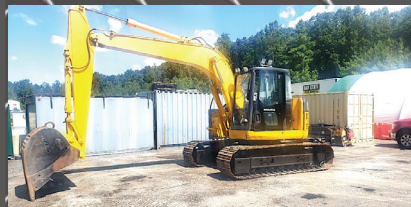
2003 KOMATSU PC128US-3. Hydraulic Excavator, 8K Hours, Komatsu Engine, Heat, AC, Switch Over Controls, Long Track, Long Boom, Zero Turn Swing, Fairly New Under Carriage, 32" Dig Bucket, Needs Teeth, Cab Needs Top & Bottom Glass, Decent Machine, $27,500. OBRO