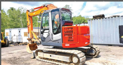
2015 HITACHI ZANIX ZX75-3US. Excavator, Zero Turn Swing, 1,900 Hours, Isuzu Diesel, Rubber Tracks, Mechanical Thumb, Blade, Heat/AC, Heated Seat, Radio, Go To Work Condition, $47,500.