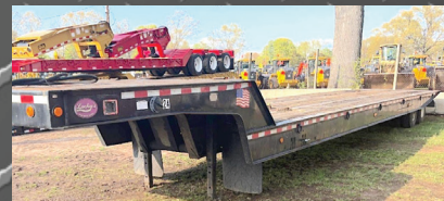
1999 LANDOLL 317 RECOVERY TRAILER. Full Tilt Bed, 50Klbs Winch, Air ride, LED Lighting, 17.5 Rubber, Hydraulic Hoses Tool Compartments, 48' Long, Heavy Duty Landing Gear, Dock Levelers, $27,500