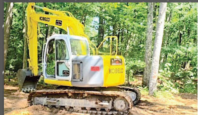
2006 KOBELCO SK135SR EXCAVATOR. 5,500 Hours, Cummins, Long Boom, Long stick, Zero Turn Swing, Aux Hyds, Plumbed For Hammer, $41,500.