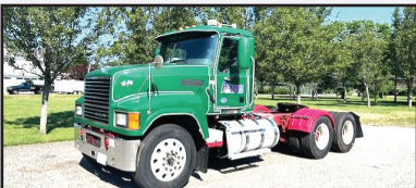
2016 MACK CHU613.

New Tires, New 12 Speed M-Drive Automatic Transmission, 700K Miles, Very Clean, $58,000.