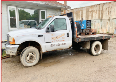
2001 Ford F-350, 7.3 Liter Diesel Flatbed, 60,323 Miles, New Intercooler, $4,000