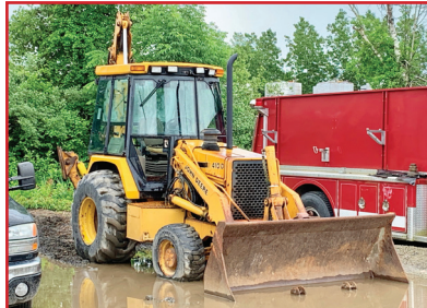
1997 John Deere 410D, Runs, Drives, Operates, Needs Floors, $6,000