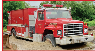
1984 International Fire Truck, 14,387 Original Miles, Immaculate Interior, Like New, Needs Carburetor to Run, $4,000