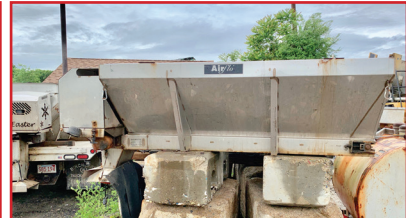
SANDERS (5 of them), All Excellent Working Condition, All Have New Motors and Straps, Extra Parts as Well, $1,500 Each or $6,000 for All of Them