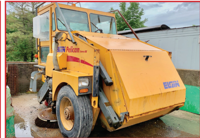
2000 Elgin Sweeper, 20,700 Miles, 4062 Hours, Runs, Drives, Operates Well, $10,000