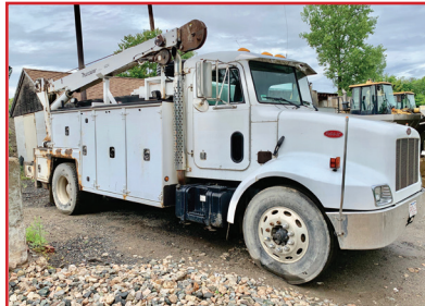
2004 Peterbilt 330 Crane Truck, 236,598 Miles, 16,872 Hours, Runs- Operates Well, Hook-Ups Work, $45,000