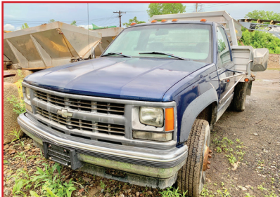
1997 Chevy 3500, 1 Ton Diesel, 96,145 Miles, New Brakes, New Tires, New Flatbed, $4,000 or $6,000 with DownEaster Sander