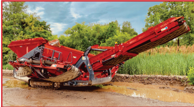
2016 Sandvik QE241, Less Than 1,000 Hours, 1 and 1/2 Inch Screens, $150,000