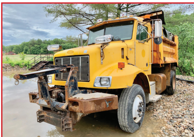
2004 Peterbilt 330 Sanding Truck, 77,013 Miles, 8,794 Hours, Brand New Brakes, Drums, and Rotors, Runs and Operates Amazingly Well, $35,000