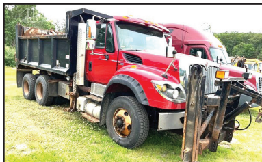
2013 IH 7600 T/A PLOW TRUCK. 14' Steel All Season Dump Body, 475 Hp., Jake, 8LL, 18 Frt Axle, 46 Rears, Chalmers Susp., 12R22.5 On Steel, Power Heated Mirrors, Heated Windshield, Pwr Window/Doors., 137,629 Miles. Serviced/DOT Ready. #301403 $47,500