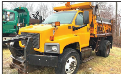
2006 GMC C8500 S/A DUMP TRUCK. CAT, Allison Automatic, Spring Susp.. 10' Steel Dump Body, 10' Front Plow. 55,775 Miles, # 405884. $13,500.

AdvantageTruckNE.COM • Follow us @WeKnowTrucks