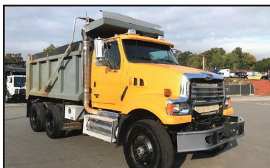
2009 STERLING T/A DUMP. MBE - 410 Hp, 8LL, 20k Front, 46k Rears., Spring Susp., 14ft Steel Dump Body, Clean, DOT Ready. 108,946 Miles. #AH8468, $49,500