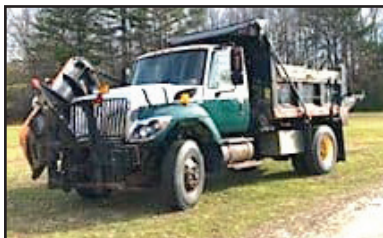
2008 INTERNATIONAL 7400. Municipal Plow Truck, Plow & Sander Electronic Controls, 10' Tenco Side Dump Body, 10' Tenco Reversible Frt Plow, 9' Tenco Wing, 105,280 Miles, #639665, $25,000