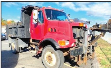
1998 FORD L8501 PLOW TRUCK. 3126 CAT, 9 Speed, Steel Dump Body, 165,821 Miles, #A04830, $9,950