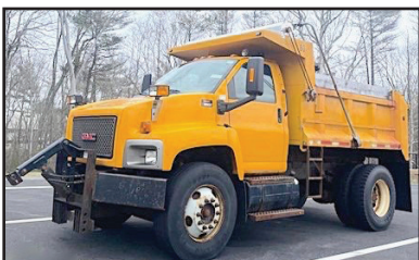
2007 GMC C8500 S/A DUMP TRUCK. Duramax Diesel, Allison Automatic, Spring Susp., 10' Steel Dump Body, 10' Front Plow. 66,320 Miles, #409376 $13,500.