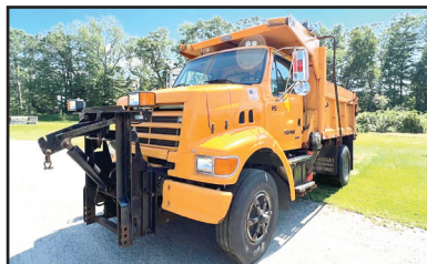
2000 STERLING L7500. 3126B CAT, Spicer 7 Speed, Spring Susp, 4.56 Ratio, 11R22.5, Highway Plow, Steel Dump Body, 73,080 Miles, #F34819, $13,500