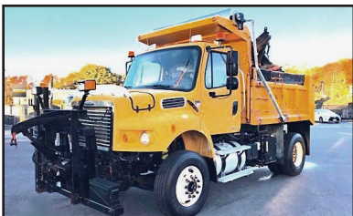
2007 FREIGHTLINER PLOW TRUCK. MBE900 280 Hp, Automatic, 36,580 GVW, 92,467 Miles, Frt Highway Plow, Steel Dump Body, DOT Inspection, #Y27431, $37,500