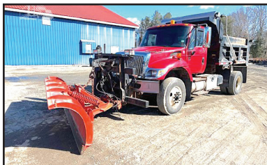
2003 IH 7400 SA DUMP PLOW. IH DT350, 8LL, 12R22.5, Steel Dump Body, Diff Lock, Exhaust Brake, #057514