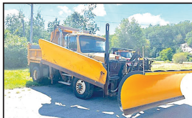
2007 FREIGHTLINER M2. CAT C7 300 HP, 8LL, Single Axle Spring Suspension, 37,240 GVW, 10' Tenco Sander Dump Body., Front & Wing Plows, 81,384 Miles, # Y16404, $24,500