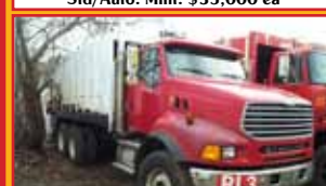
2001 STERLING. C12-410 Hp, 8LL, 18 Frt Axle, 46 Rears, 145k Miles, 25 Yd Rear loader. Will Separate.