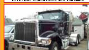
2005 IH 5900i HEAVY SPEC HAULER. 465Hp ISX Cummins, 18 Spd, Jake, Wet Line, 14 Frt Axle, 46 Rears, Air Ride. #4985