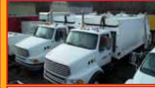
TWO 2004 STERLING RUBBISH HAULERS. Mercedes 410 Hp, Automatic, 25 Yd Rear Loader, 16 Frt Axle, 46,000 Rears, 30k-40k Miles.