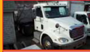
2007 FREIGHTLINER COLUMBIA. T/A, Mercedes 450 hp, 10 Spd, Air Ride, 25k Miles. $54,900.