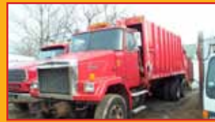
1990 AUTOCAR. Automatic, 20 Frt Axle, 58,000 Rears, w/ 1999 LEACH 2R2 31 Yd Rubbish Body.