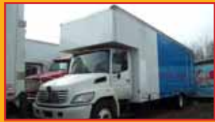
2007 HINO 338 MOVING VAN. 260 Hp, Allison Automatic, Air Ride, 25,000 Miles. Also '05 & '06 Hino 268's under CDL, Will separate