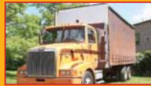
2000 WESTERN STAR 5864SS. ISM330 Cummins, 15 speed, air ride, tandem axle, 440k miles, 16F/42R, 24.5 tires, 25' side body with tool box mounted at front of body. CALL