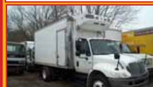
2006 IH 4300 MORGAN REFRIGERATED VAN. Automatic, Lift Gate, Thermo-King, Low hrs, 57,000 Miles, Air ride, Will separate. #5086