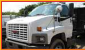
2005 GMC C7500 Diesel, Allison Automatic, NON CDL, we'll mount any body for you. 30k actual miles. NAP