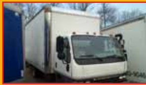
2004 MITSU-FUSO FE 16' VAN. Automatic, 25k Miles, two available.