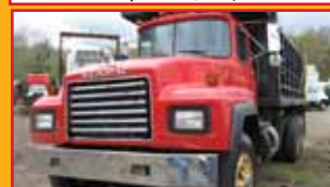
1995 MACK RD 10 wheel dump truck. runs good. needs TLC. $25,000