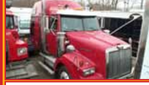
2004 WESTERN STAR. Mercedes 460 Hp, 13 Spd, Jake Brake, Air Ride, 170k ECM Miles.