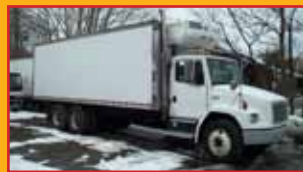
2003 FREIGHTLINER FL80, 24' REFRIGERATED VAN BODY, 150K Miles, 250hp CAT, 10 Speed, 12 Frt Axle, 40,000 lb Rears, Excellent Cond., Runs & Looks New.