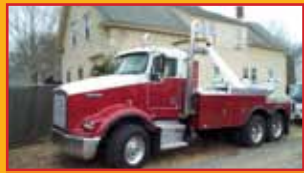
1999 KW T800 CHALLENGER WRECKER. 18 Frt Axle, 46 Rears, 195k Miles, Looks New, Under Reach.