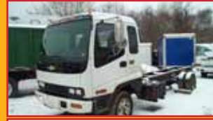
2004 CHEV WT5500 CAB & CHASSIS. Automatic, Isuzu Diesel, 19,500 GVW, NEW MOTOR