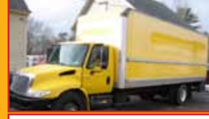
'96 to '06 International Box Trucks! Vans, flatbeds, refers, auto, & standard, 8 available and ready to go.