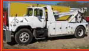
1993 MACK DM WRECKER: 688X 300 h.p., Allison automatic, 62K original miles, 187/29R, heavy single axle, 35 ton WELD BUILT EXT. BOOM, heavy under reach, will separate. call for info.