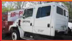
Damaged '03 FREIGHTLINER M2 Crew cab, hit front end, usable cab, make your truck a crew cab. call.

1700 Broadway - Rte 138 - Raynham, MA • Take Exit 8 Off Rte 495, East Rte 138, On Your Left