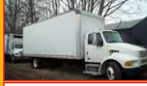
2005 STERLING 24' VAN. 60k Miles, Mercedes Diesel, Automatic, Air Ride.