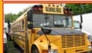
1999 INTERNATIONAL SCHOOL BUS: DT466, 6 speed standard transmission. 80K miles. very nice condition. $7,500