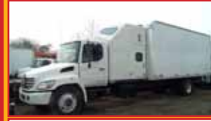
2006 HINO 338 EXPEDITO. 24' Van Body, Sleeper Bunk, 40k Miles, Loaded, Std/Auto. Mint. $35,000 ea