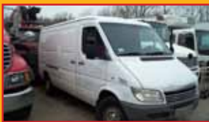
2004 SPRINTER VAN. Diesel, Auto, A/C, 115k Miles. Also 05 w/ 80k Miles.