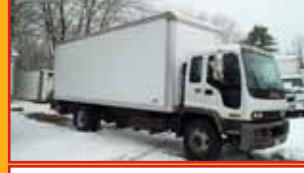
1998 Isuzu FTR call. Also '02 GMC w/ box $10,000