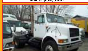
1999 IH 8100. DT-530, 10 Spd, 220k Miles. 1991 INTERNATIONAL TRACTOR AVAILABLE