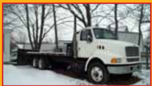
1998 FORD 28 FT STEEL ROLLBACK EQUIPMENT CARRIER. C10 CAT-300hp, 10 Speed, 14 Frt Axle, 46,000lb Rears.