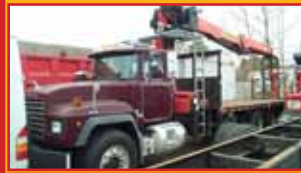
2003 7 Story PALFINGER BOOM Selling Boom ONLY. call for details.